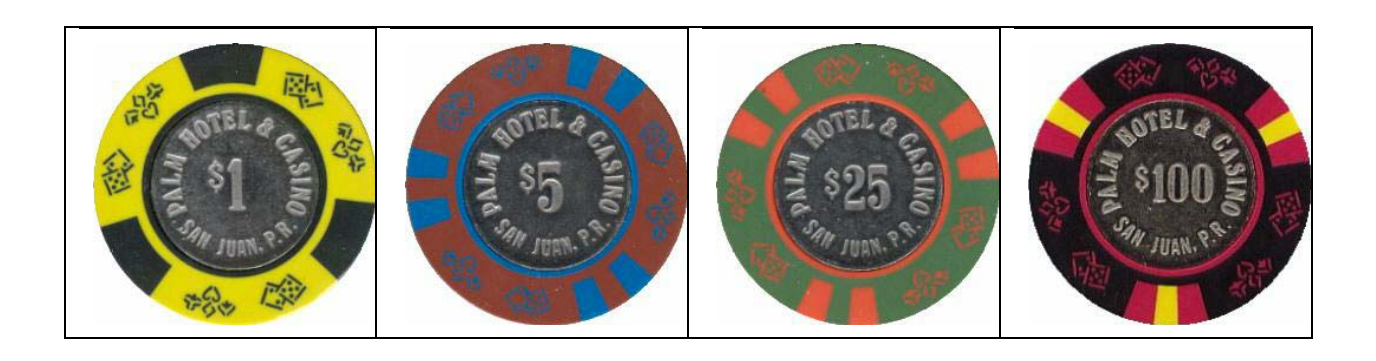
Eventually the hotel and casino did reopen and is today known as the San Juan Marriott.